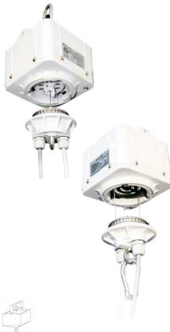
Dimensions: CSI-12 M